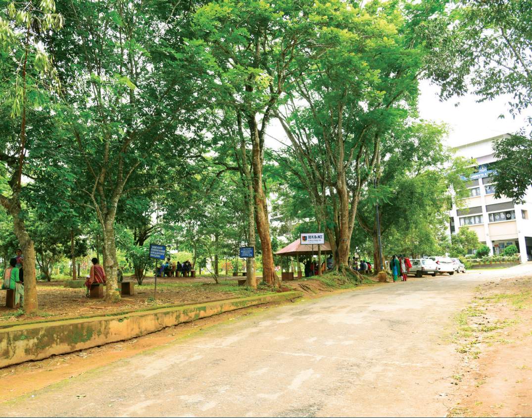
St. Mary's College Sulthan Bathery