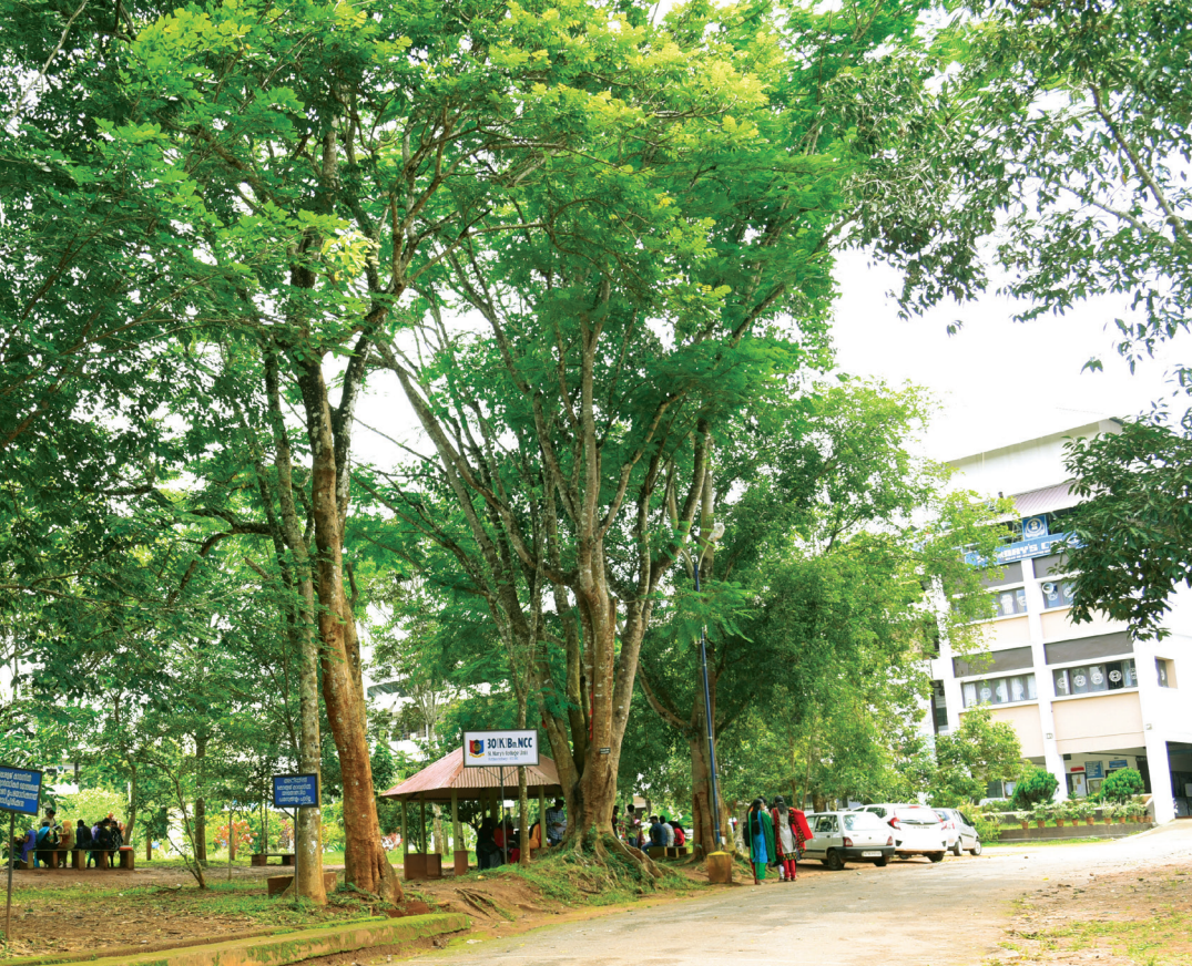
St. Mary's College, Sulthan Bathery