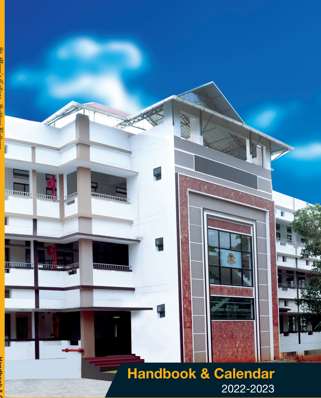
Handbook & Calendar 2022-2023