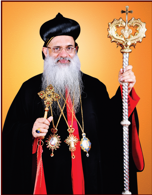
His Holiness Baselios Marthoma Poulose II 91 st Catholicos of the East EDUCATIONAL AGENCY