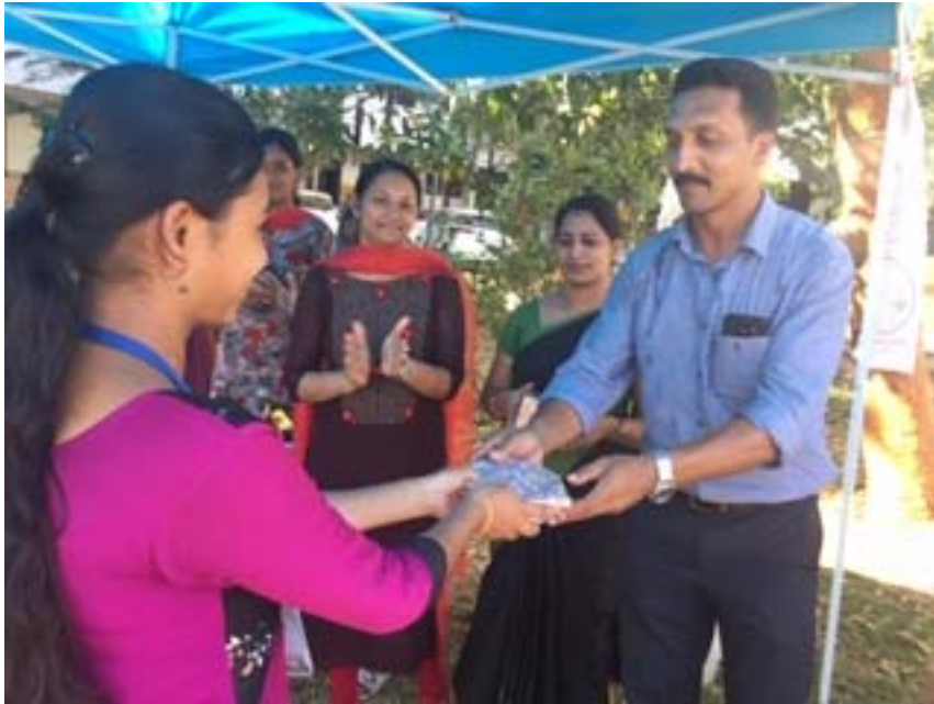
Prize distribution for the winners