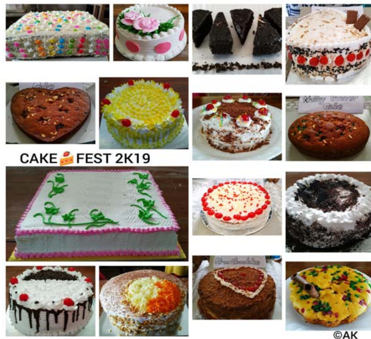
The variety cakes prepared by SMC students